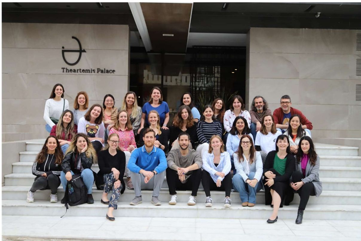
Picture from the 2023 writing week in Crete