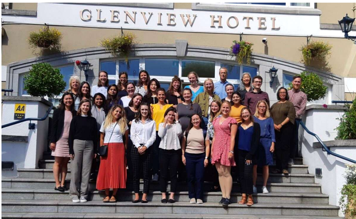
Picture from the 2022 summer school in Dublin, Ireland