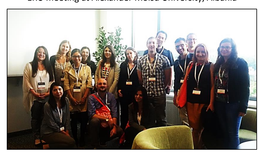
ERU at 15<sup>th</sup> biennial meeting of the International Society for the Study of Behavioral Development, Lithuania